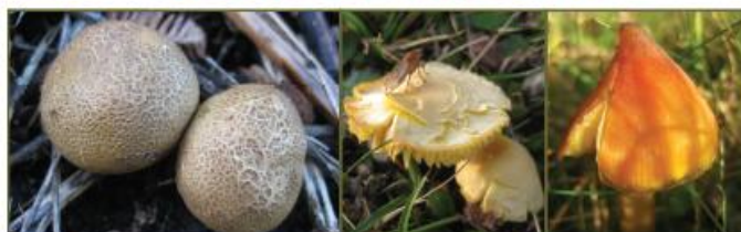
Above photos: Scaly earthball ( Scleroclema scrobiculatum ), Yellow waxcap ( Hygrocybe chlorophana ), Blackening waxcap ( Hygrocybe conica )

The Blackening Waxcap ( Hygrocybe conica ) is perhaps the easiest to recognise. Starting with a bright red/orange cap on a yellowish stem, the tip of the cap gradually turns black and eventually the whole fruitbody blackens.