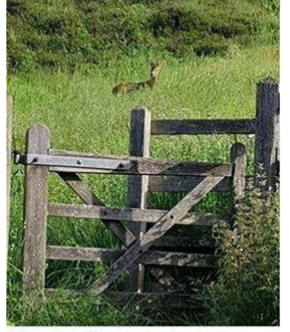
When are they going to replace that gate?