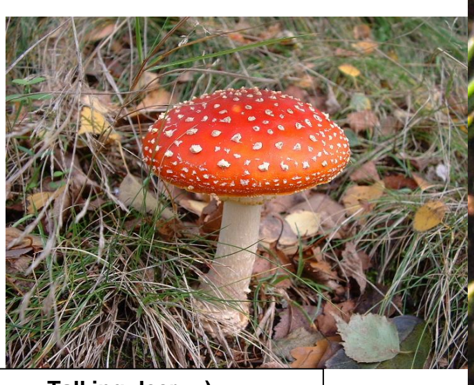
Talking deer ;-)

Lichen and fungi to be found on Troopers Hill - we are prouder of our waxcaps but the fly agaric does make a striking image