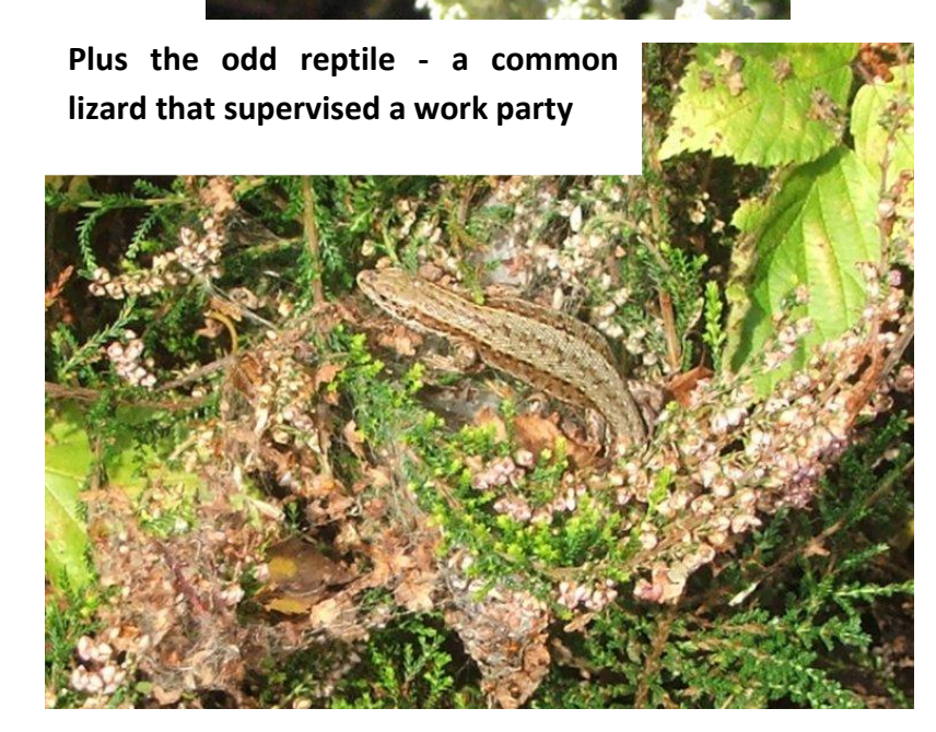
Page 8 of 11