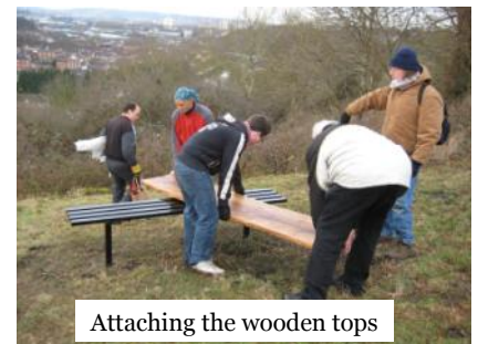
Attaching the wooden tops

The aim was to replace the elderly and rotting fence and gates along Greendown and on the corner of Troopers Hill Road and also replace the benches built and installed by Friends in 2006 . Those benches lasted only a couple of months before being destroyed by vandals. The new benches have been positioned to give a view