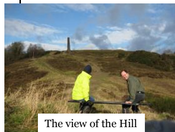
The view of the Hill