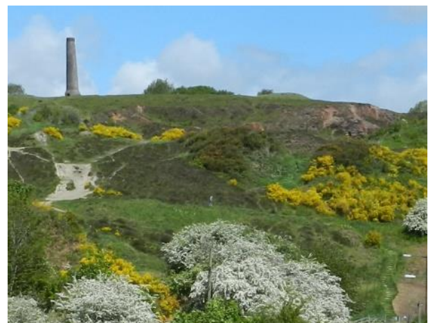
Descriptions of Troopers Hill in St George feature throughout Scenes .

The second collection Realities of Life was published in 1838, and mentions St George throughout.