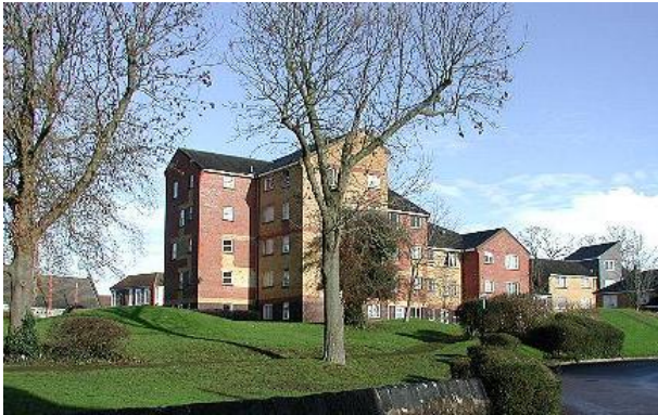
The site of St George church and churchyard which feature in Scenes now contains a residential housing development.