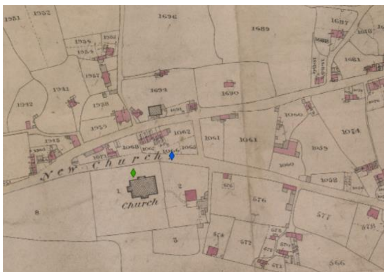
Tithe Map showing St George in 1840s. Click to view Bristol City Council mapping system.