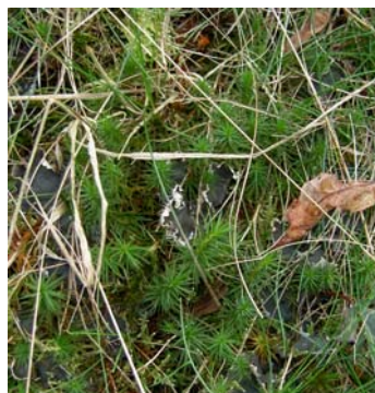
The moss on Troopers Hill