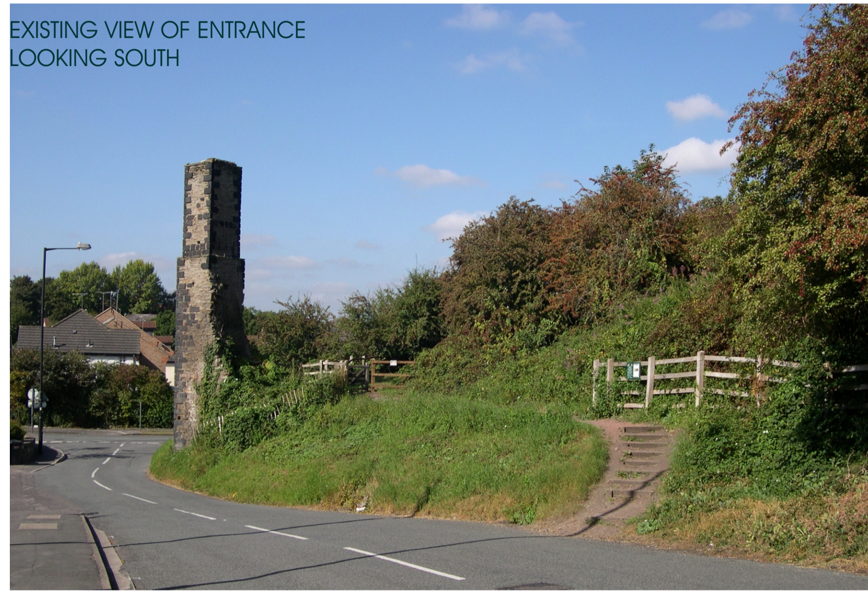
EXISTING VIEW OF ENTRANCE LOOKING SOUTH