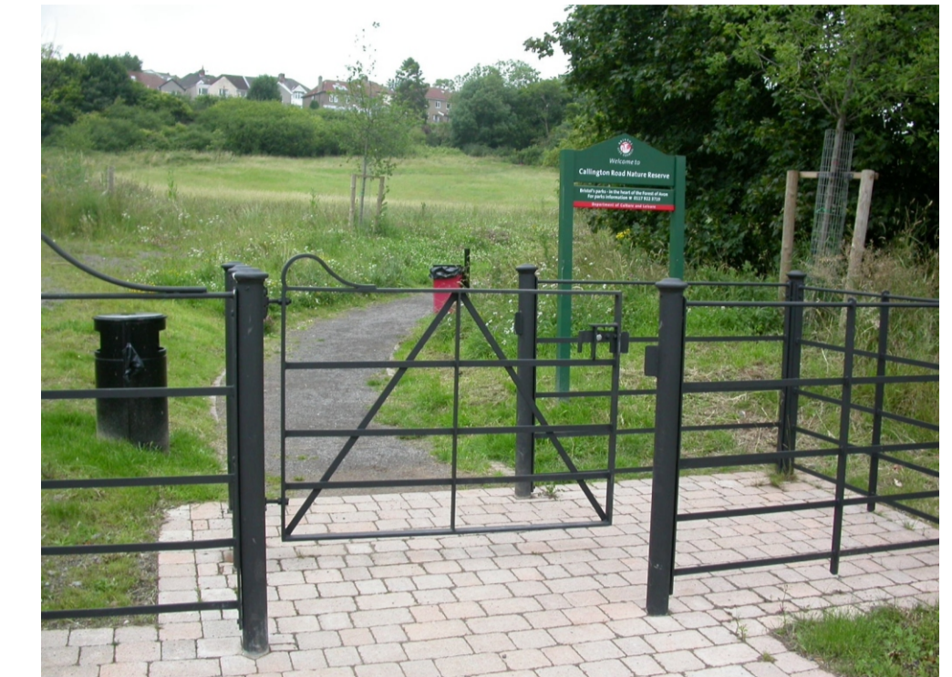
EXAMPLE ESTATE FENCING & KISSING GATE NEAT & VISUALLY RECESSIVE