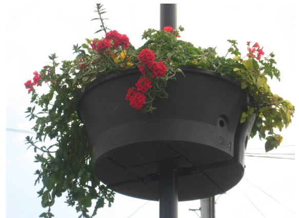
Flower Baskets in Prime Locations