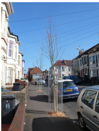
Kensington Rd, Street Trees