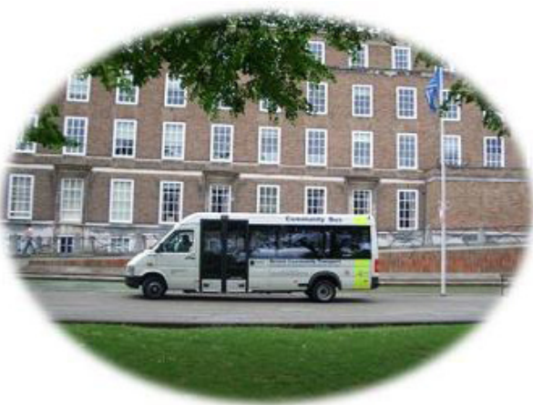
Community Bus for Hillside Court

Listed below is a range of community projects, which the St. George Neighbourhood Partnership supported since it was formed. This list is by no means complete, we are very keen to hear from you if you have an idea or suggestions to improve the St. George area.