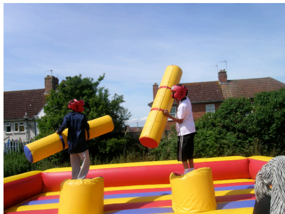
Meadow Vale Fun Day