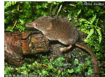
Figure 1.4 Pygmy shrew ( Sorex minutus )