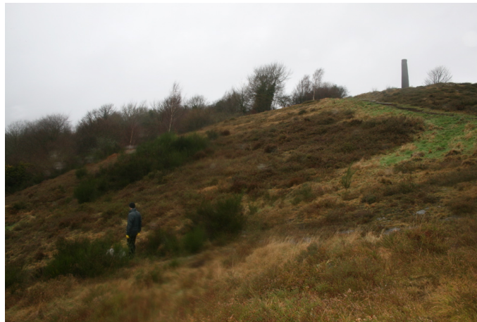
Figure 2.1 The heathland facing north towards the chimney

When laying the traps for the first time in January 2008 it was clear that it was not going to be an easy task. It was a cold day and there was persistent heavy rain all day as well as persistent rain forecast by the Met Office. The site visit and study area selection started with the heath. There was little vegetation in the north of the site near the chimney as it is mainly grassland that is kept short as it is frequented by families visiting to enjoy the commanding views over east Bristol. The area around the gully was also unsuitable for the sighting of the traps due to the lack of foliage and the steepness of the banks. The southern part of the site was the best as it provided enough plant cover for the traps although it was much lower than it is in spring and summer. “Sometimes in winter, reddening and death of Calluna foliage occurs” (Webb, 1986). It was possible that this was a cause of the reduced amount of foliage showing.