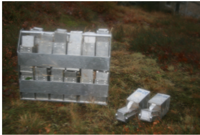
Figure 1.5 Prepared traps in carrying case