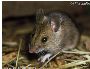
Figure 1.3 Wood mouse ( Apodemus sylvaticus )