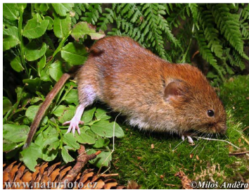
Figure 1.2 Bank vole ( Clethrionomys glareolus )

Dr Pocock advised that if the yellow-necked mouse was found in the wood, and that it was possible to trap one, it would have to be handled with care as they are agile and ferocious when caught and will squeal and bite in order to escape. This is backed up by Paul Sterry's book Complete British Animals , published in 2005, which quotes “they are remarkably agile and ferocious in the hand, and will bite, squeal and wriggle with alarming vigour”. With this all of this new information in mind the habitats, diet and predator information for the wood mouse, shrew species and the bank vole were considered.