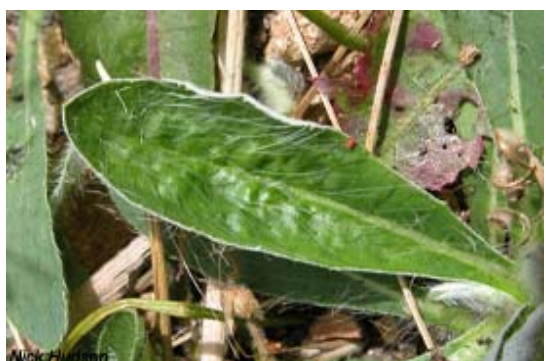
The long-haired leaves of Mouse-ear-hawkweed.