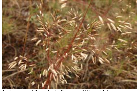
A close-up of the minute flowers of Wavy Hair-grass.