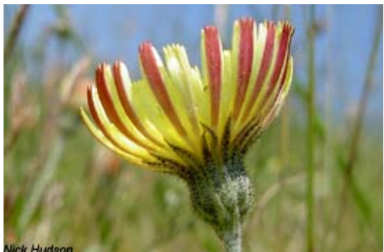
The pale-yellow flower of Mouse-ear-hawkweed with conspicuous red striping on the undersides.