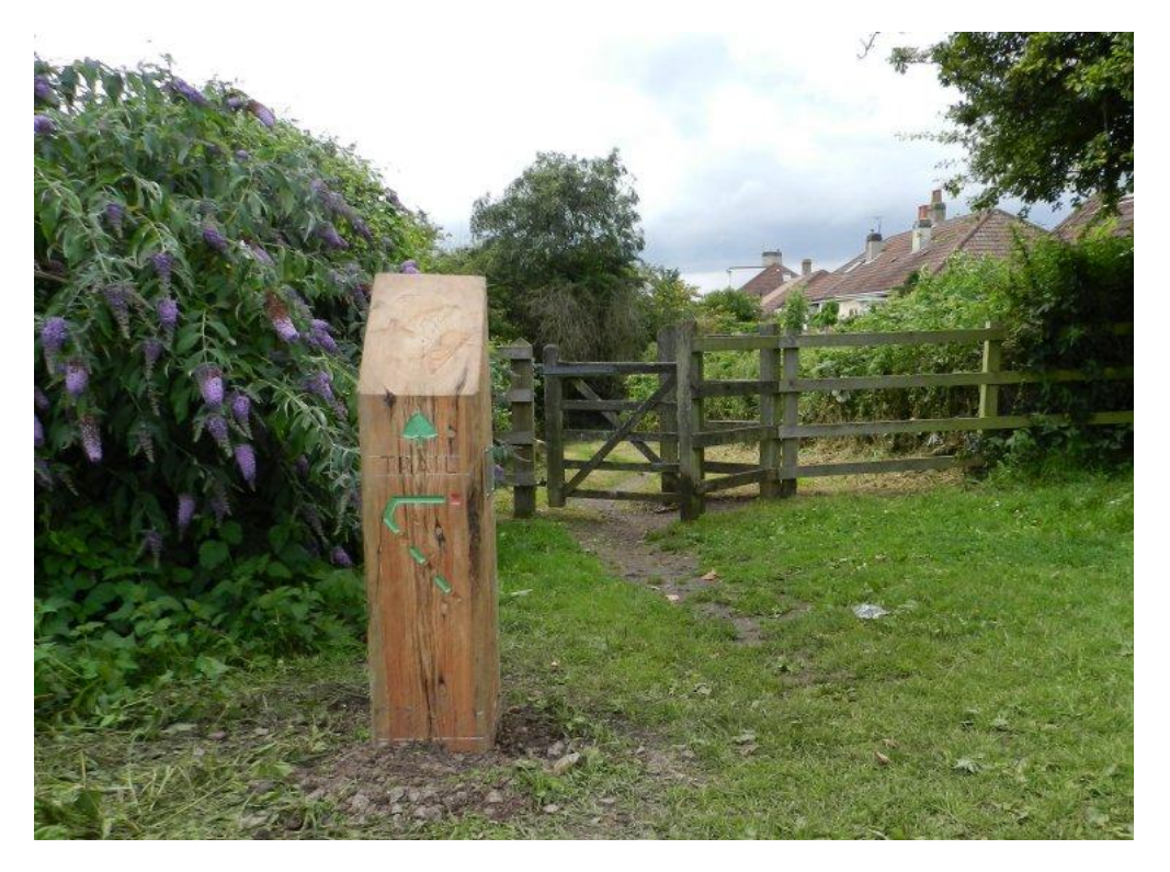
In 2013 Friends of Troopers Hill were allocated Section 106 (contribution from developers to the Council to offset the impact of developments) funding from the St George Neighbourhood Partnership Environment Sub-group to pay for a path from the Malvern Rd

In Friends of Troopers Hill successfully applied for Lottery funding which was awarded in 2012. These funds paid for the "Welcome to Troopers Hill Field" information board at the Summerhill Terrace entrance and 2 land drains at the wettest part of the Field to try to address the lying water problem. Using the same funds a waymarker for the woodland trail was put near the wooden kissing gate leading from the Field to Troopers Hill Woods.